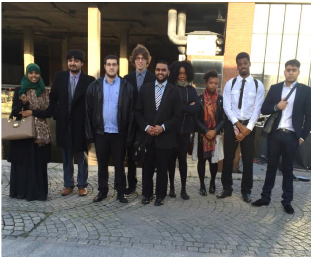
Trainees from our 14 th Spear programme on a company visit

Please see below some highlights from last term as well as some dates for your diary!